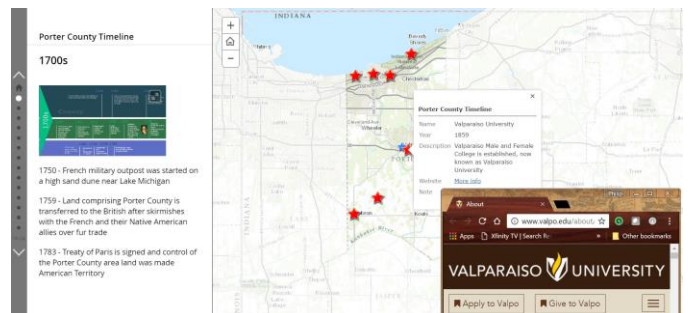
Figure 4: IndianaMap Porter County Map Example