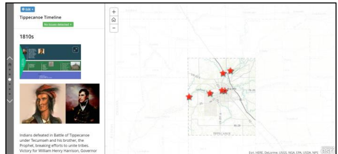
Figure 2: Tippecanoe County Timeline Map Example