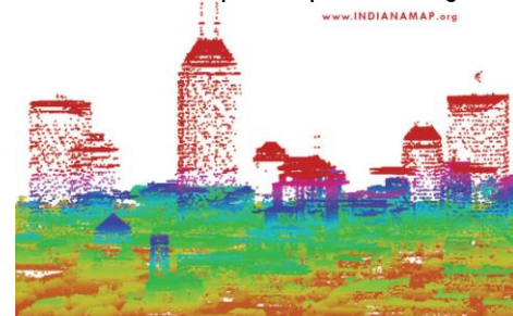
LiDAR image of downtown Indianapolis