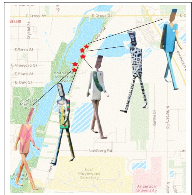
Figure 2. Digitized 3D models of Walking Man statues mapped in Shady Side Park in Anderson, IN.