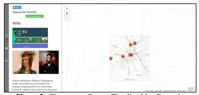
Figure 2: Tippecanoe County Timeline Map Example