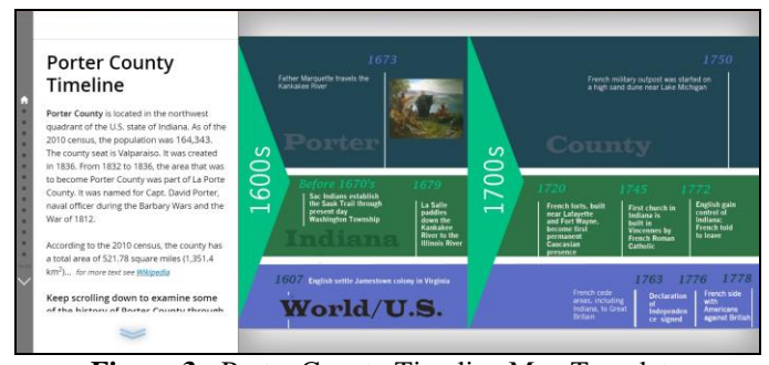
Figure 3: Porter County Timeline Map Template [LINK]