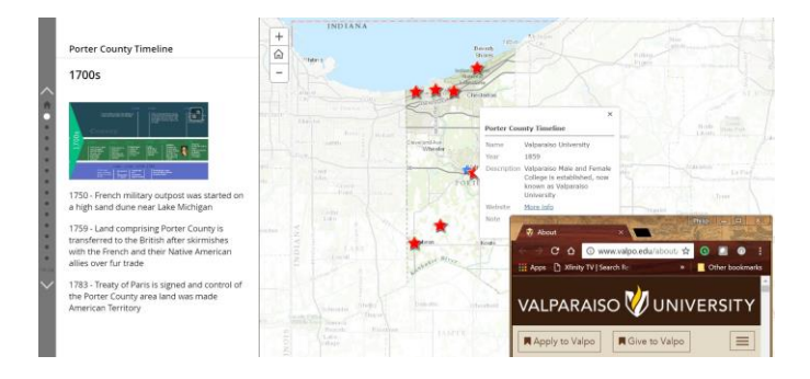
Figure 4: IndianaMap Porter County Map Example