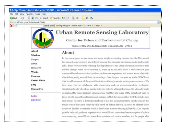
Figure 1. Urban Remote Sensing Lab web home page. Web address - <u>http://cuec.indstate.edu:3000/</u>. This web will also serve as an information hub for sharing and disseminating research results and pertinent information, and interacting with urban remote sensing researchers.

Weng, Q., Liu, H., Liang, B. and D. Lu. 2008. The spatial variations of urban land surface temperatures: pertinent factors, zoning effect, and seasonal variability. IEEE Journal of Selected Topics in Applied Earth Observations and Remote Sensing , 1(2): 154-166.